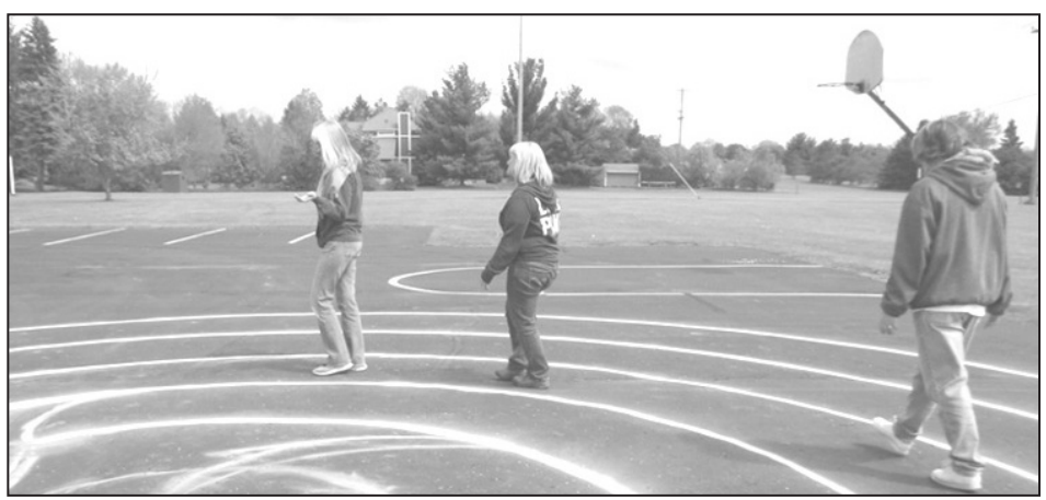
Laying out HFC's labyrinth in 2014.

Labyrinths can be traced to the earliest antiquity — painted on ancient pottery, in woven products, or carved into wood. In the Middle Ages, they became a central feature in many European churches with several still existing today. The most famous of the labyrinths is at Chartres Cathedral near Paris, France, built around 1200. For Christians in the Middle Ages, walking a labyrinth served as a substitute for an actual pilgrimage to Jerusalem.