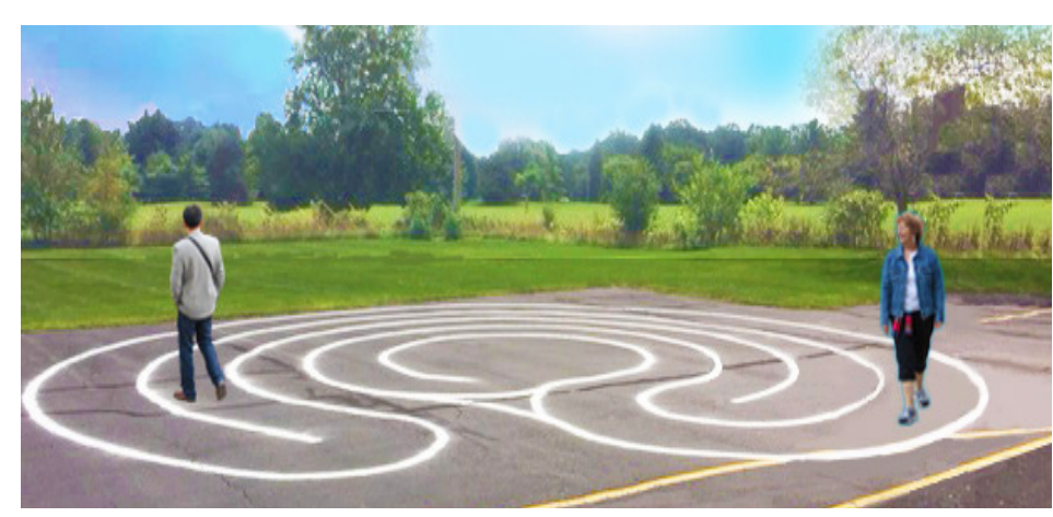
Labyrinth after repainting in 2018.

When walked as a pilgrimage, the labyrinth walk represented a journey to become closer to God. When used for repentance, pilgrims would walk on their knees.